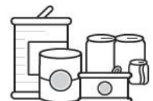
Metal & Aluminum