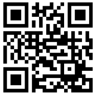
Actual Print Size